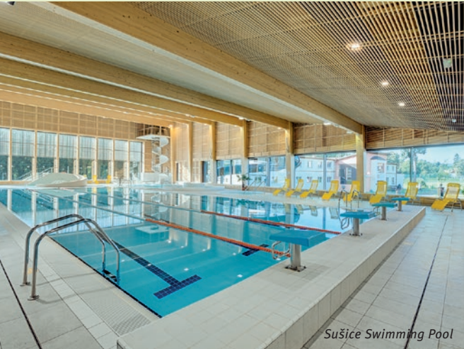
Sušice Swimming Pool

The swimming pool offers several excellent attractions. A waterslide with light and sound effects and a time clock so you can have a race with your mates. A separate, 25 m long swimming pool has designated lanes for swimming and features a river current system . The children can enjoy a pool with a wild river effect in any weather, or the paddling pool , and the parents can rest in one of the Jacuzzi pools . There is a Finnish sauna and a traditional steam room . This is a wonderful opportunity to rejuvenate your body and forget about everyday