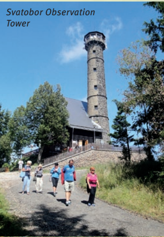
Svatobor Observation Tower