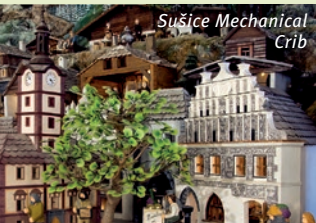
Sušice Mechanical Crib

Sušice Mechanical Crib: models of important buildings in the town and the surroundings, showcasing traditional Šumava crafts.