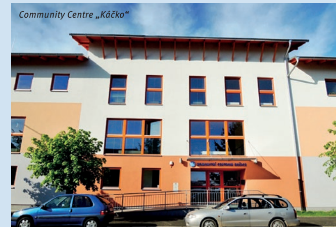
Community Centre „Káčko“

The centre was built in 2012 and it houses an After School Club , a multi-function hall and an outdoor amphitheatre for various social events. It also houses the municipal library , a reading room and offers Internet access to the public.