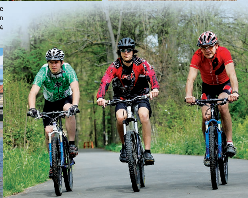
Otava Cycling Path