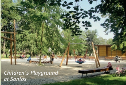
Children's Playground at Santos

The island of Santos is located in the Luh Woodland Park, between the River Otava and the Mlýnský Stream. The municipal woodland park was renovated in 2012-2013 thanks to the Fund for Revitalisation Changes. The large modern playground is extremely popular with children, whilst their parents enjoy refreshments in the local café. There is a skittle alley near the playground. At one end of the island, you will find an outdoor swimming area with changing rooms , and at