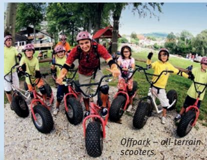
Offpark – all-terrain scooters