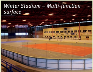
Winter Stadium – Multi-function surface