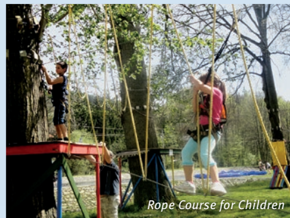
Rope Course for Children

The gold bearing River Otava is formed when two Šumava rivers, the Vydra and Křemelná meet at Čeňkova Pila. The river flows through some wonderful scenery and picturesque historical towns such as Sušice, Horažďovice, Strakonice and Písek. It joins the River Vltava just below the Zvíkov Castle. The Otava is one of the most popular rivers with canoeists as they can enjoy practically all of its 113 km long course. For more experienced canoeists, the section from Čeňkova Pila to Sušice (in spring) is the most interesting one as the river is wild, offering lots of excitement and adrenalin moments. However, from Sušice onwards, the river opens up to even less experienced canoeists. Even if you do not have a canoe, but would like to have a go, you can take advantage of the various rental places where you can arrange a one day or several day long trips down the Otava.